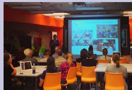
Attendees at the 2014 MER Annual Forum, held at ARTLAB+, Hirshhorn Museum and Sculpture Garden."